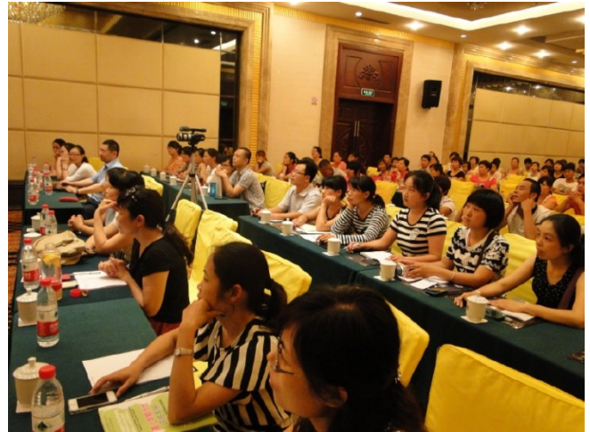
Presentation to parents and staff of early intervention centres.